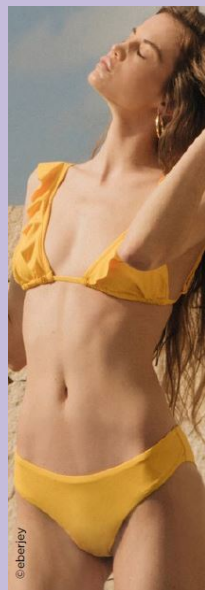
THE ESSENTIALS & COCOONING